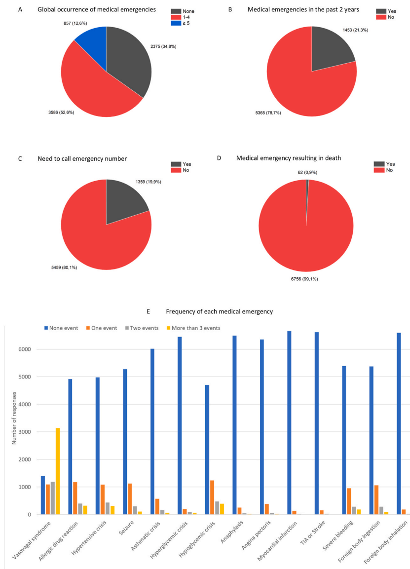
Fig. 2. Answers of study participants to the questions: A) how many medical emergencies have you encountered in your professional practice?; B) have you had any medical emergencies in your professional practice during the past two years?; C) have you ever had to call 112 (emergency phone number) seeking for emergency medical support?; D) have any deaths ever occurred in the dental setting in which you work?; E) have any of the following medical emergencies ever occurred in the dental setting in which you work? (please indicate the number of events).

The commonest medical emergency was the vasovagal syndrome, followed by hypoglycaemic crisis, seizure, hypertensive crisis, allergic drug reaction, severe bleeding and foreign body ingestion (Fig. 2E). Most of medical emergencies occurred during the procedure (n = 4883; 71.6%) and/or at the end of the procedure (n = 2203; 32.3%).