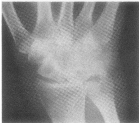
Fig. 2 Radiograph of the right wrist revealing classical changes of adult Still's disease including intercarpal and carpal-metacarpal narrowing and fusion.

dyspnoea, and pulmonary function tests revealed no significant improvement.