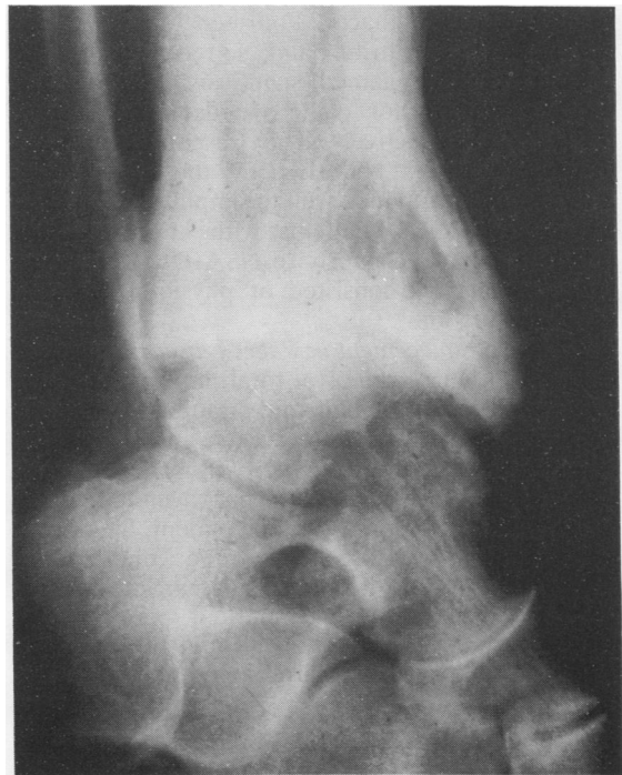
Fig. 2 Paget's disease in a tibia with arthritis of ankle.

Back pain and Paget's disease. Eighteen patients complained of back pain and stiffness, particularly after immobility, and on x-ray all had degenerative disc disease characterised by disc space narrowing, sclerosis of vertebral bodies, and osteophyte formation. However, only seven had spinal Paget's