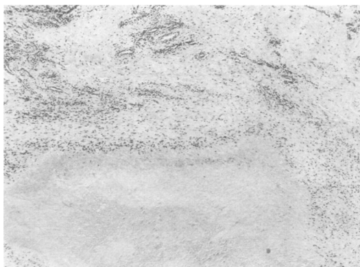
Fig. 1 Foot nodules. Palisading histiocytes surrounding foci of necrosis and perivascular lymphoplasmocytic infiltration are evident. (Haematoxylin and eosin.)

Biopsy specimens were obtained from the old nodules (elbows) and from the new ones (dorsum of the feet). The recent nodules (Fig. 1) demonstrated dense connective tissue surrounding palisading granulomas with central fibrinoid necrosis and prominent perivascular infiltrate of lymphoplasmocytic cells (Fig. 1). The old nodules showed denser connective tissue surrounding necrotic nodular areas without peripheral palisading, irregular collections