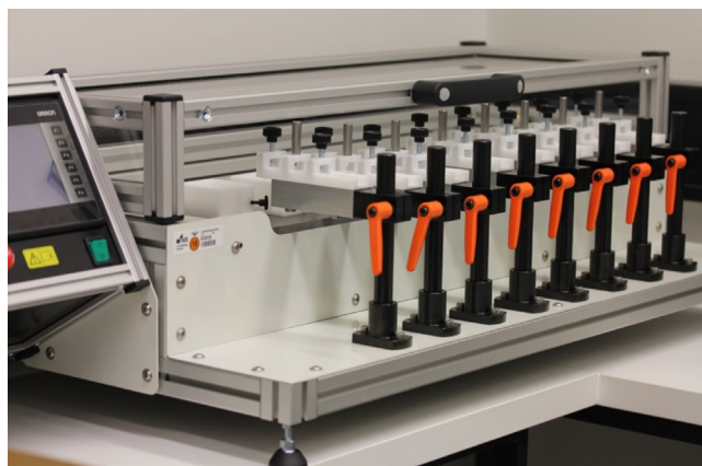
Fig. 1 Toothbrush stimulator (Omron SD Mechatronik).