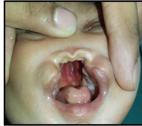
Figure 2: Complete cleft upper lip with complete cleft hard and soft palate.