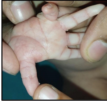
FIGURE 4: Simian crease in hand.