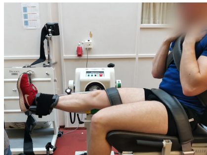
Figure 3. Testing position of knee extension and flexion.