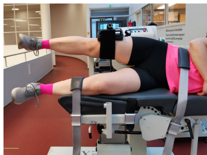
Figure 4. Testing position of hip abduction and adduction.