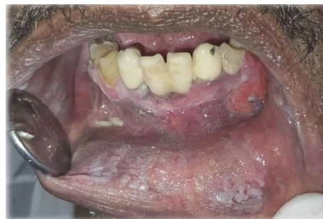
FIGURE 2: Patient of OSCC with wide field of cancerization (white-smoke discoloration).

Data were entered in a computer master sheet using SPSS version 26. Statistical analysis was set at 95% confidence level, 0.2, the width of the confidence interval, and the level of significance alpha is 0.05. Chi-square test was used to test the difference between categorical variables, and Fisher’s