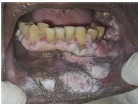
FIGURE 1: Patient of OSCC associated with different mucosal changes of wide field of cancerization (grizzle and cotton-white presentations).

clinically and histologically normal tissue, which could elucidate the concept of the field alteration of cancer [10]. One of the known clinical characteristics of wide field of oral cancerization is the wide involvement by OSCC at multiple oral cavity sites. Clinically, the “Snuff Dippers’ Lesions” present as varieties of presentations ranging from wrinkling to different discolorations associated with different mucosal thickening [11]. In the last decade, Suleiman reported five different presentations of clinical mucosal changes at the site of Toombak dipping among Sudanese dippers: Presentation I: wrinkling with slight discoloration, Presentation II: Café au lait discoloration (brownish discoloration), Presentation III: white-smoke discoloration, Presentation IV: grizzle (a mixture between white and dark discoloration), and Presentation V: cotton-white discoloration [6]. Recently, Abdalla et al. [12] described in their clinical examination of their patients the predominance of “Presentation I” in 43.5% of the cases, followed by Presentations: III and II accounting for 16.1% and 14.9%, respectively. The present study is aimed to describe the different clinical presentations and mucosal changes of WFC of OSCC patients in Sudan.