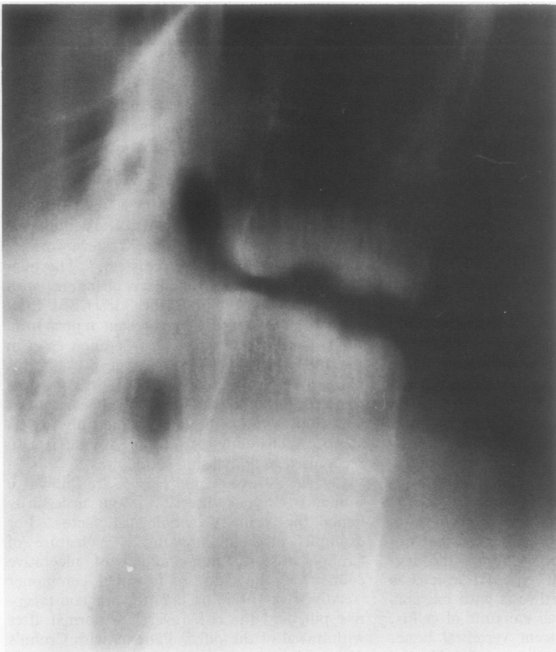
Lateral tomogram of T10 and T11 vertebrae showing an erosive sclerotic reaction and a defect through the posterior articulation.

A decision was made to fuse the spine at