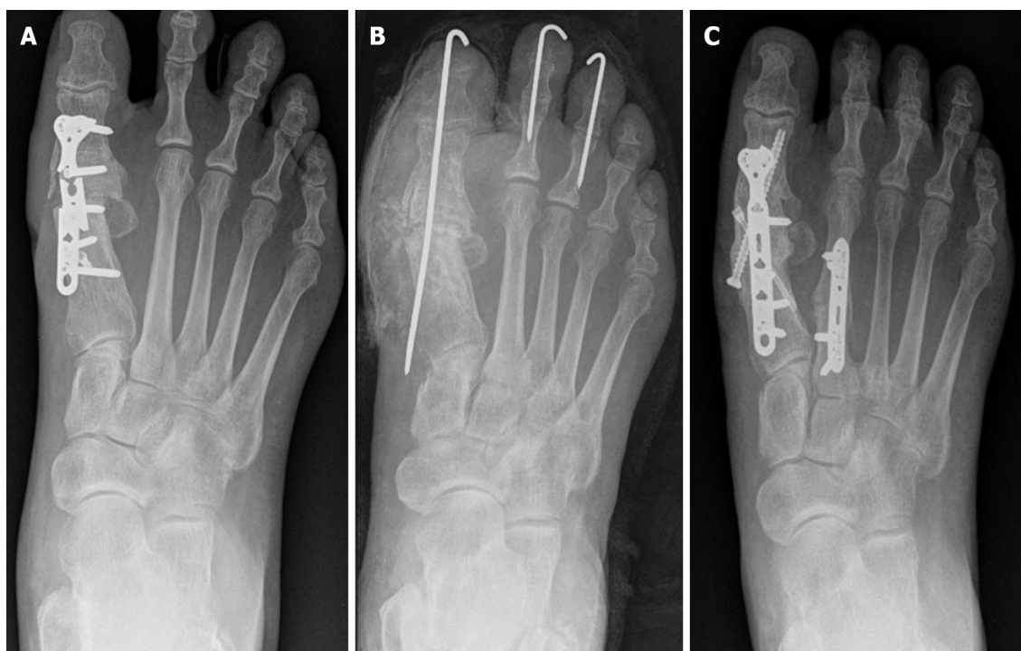
DOI: 10.5312/wjo.v14.i3.136 Copyright ©The Author(s) 2023.

OM: Osteomyelitis; ORIF: Open reduction and internal fixation; MSSA: Methicillin sensitive Staphylococcus aureus.