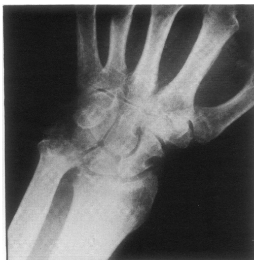
Figure 3 Radiograph showing erosions of the right carpus and ulna styloid.