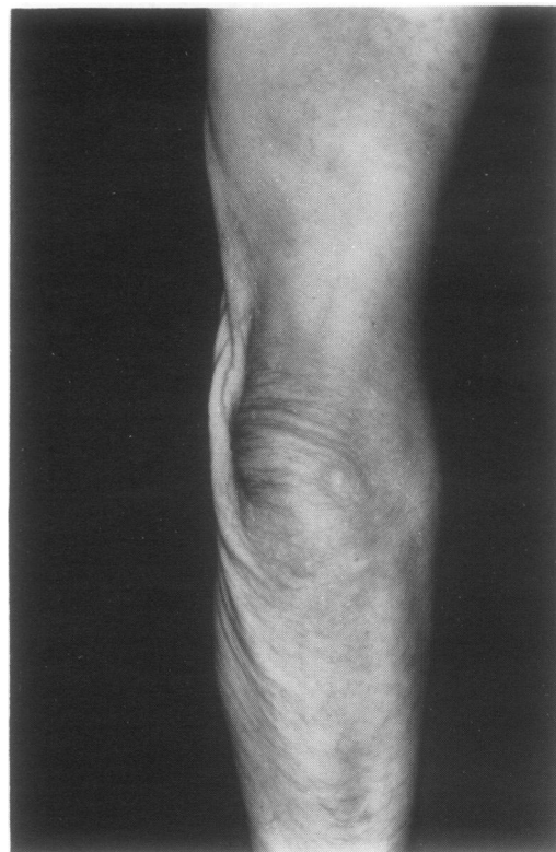
Figure 4 Regression of nodules following excision of an associated malignancy.

Frusemide alone (40 mg daily) was adequate to control his symptoms within a few days of excision. Four months after the operation there was no sign of cardiac failure and the cutaneous lesions had substantially regressed (fig 4). The heart size on a chest radiograph and the ventricular function at echocardiography were within normal limits. Repeat magnetic resonance imaging confirmed the improvement with a uniform signal intensity over most of the left ventricular wall and interventricular septum. There were no new erosions on hand radiographs.