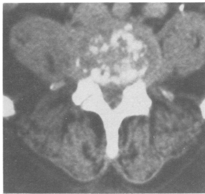
Figure 2 Computed tomography scan obtained three weeks after admission to hospital showing multiple bone erosions of the superior vertebral end plate of L5 with swelling of the surrounding soft tissues.

Results of two dimensional echocardiography were normal. Culture of a discverte-