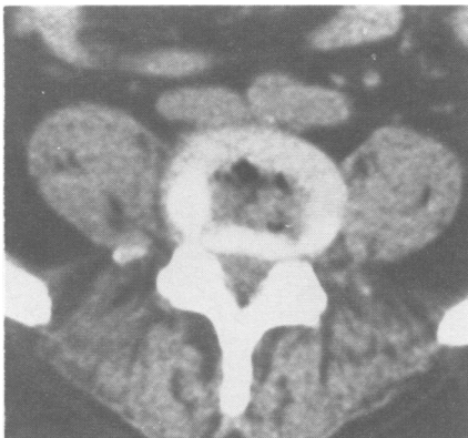
Figure 1 Gas in the L4-5 intervertebral disc space shown by computed tomography.

Orbital pseudotumours are a group of noneoplastic processes that produce intra-orbital mass lesions. 1 Idiopathic orbital myositis, a subgroup of orbital pseudotumour, is characterised by inflammatory infiltration of one or more extraocular muscles. 2,3 Although