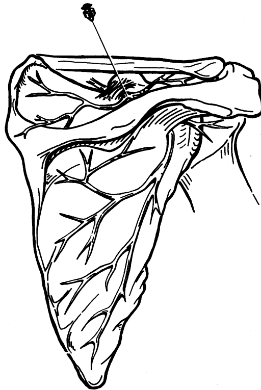
Figure 1 Suprascapular nerve traversing the suprascapular notch under the transverse scapular ligament.

Approximately half of the nerve block drug was injected into the suprascapular fossa (to block the branches of the suprascapular nerve). The