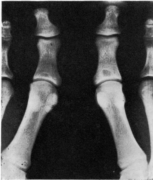
FIG. 2. Radiographs of first metatarsal joints of Case 1.