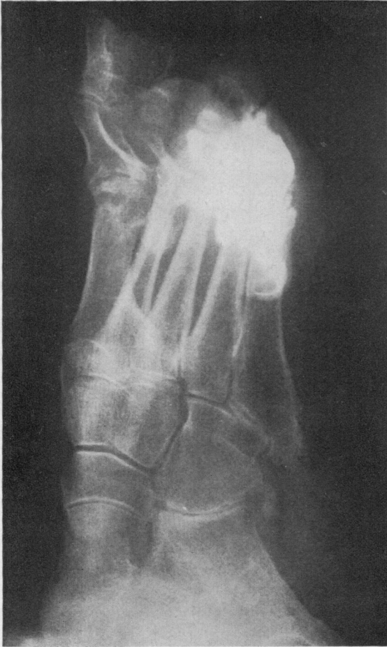
FIG. 2 Outline of the cystic mass after injection of contrast material

through the same needle. A large irregular mass that extended to the dorsum of the foot was outlined.