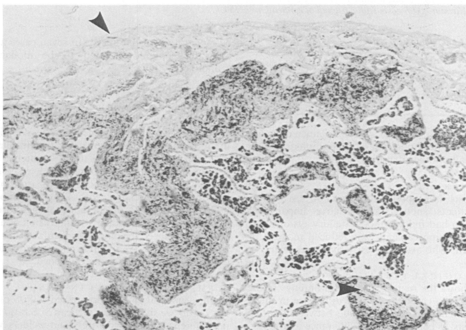
Fig 1 Lower magnification shows lung periphery with pleura. Delicate intra-alveolar septa are next to thickened septa with deposition of iron and fibroplasia. There is focal fibrosis of pleura and thickening of blood vessels (arrowheads). (Haematoxylin-eosin stain, original magnification \times 50 .)

Table 1 shows individual patient profiles, chest radiographic abnormalities, and pulmonary function results. Age ranged from 31 to 63 (mean 49.3) and the duration of welding from eight to 40 years (mean 22.8). All were symptomatic and complained of dys-