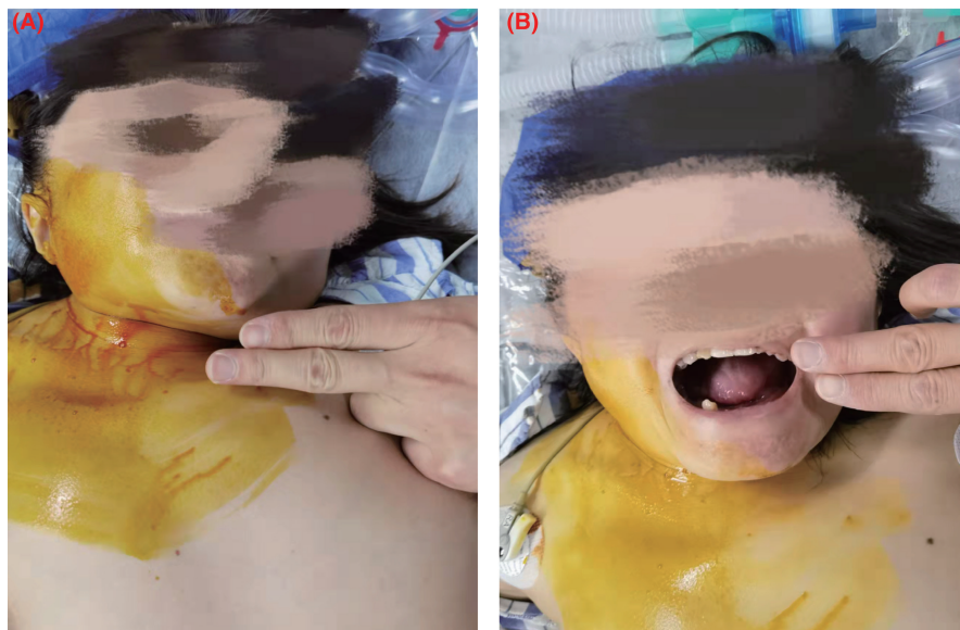
FIGURE 2 Preoperative airway examination. (A) Short and restricted neck. (B) Restricted mouth opening, a Mallampati class IV classification, missing lower teeth, and irregular upper teeth.

A female infant 980 g in weight and 35 cm in length with normal morphology was delivered. The baby had mild neonatal asphyxia with Apgar scores of 6, 8, and 8 after 1, 5, and 10 min, respectively, and was transferred to the neonatal intensive care unit with tracheal intubation. Oxytocin (10 µ) and hemabate (250 µg) were administered to the myometrium to reduce the risk of uterine atony. The operation lasted 45 min, and estimated blood loss was 500 mL. Crystalloid (700 mL) and colloidal solutions (200 mL) were applied, and urine volume was 250 mL.