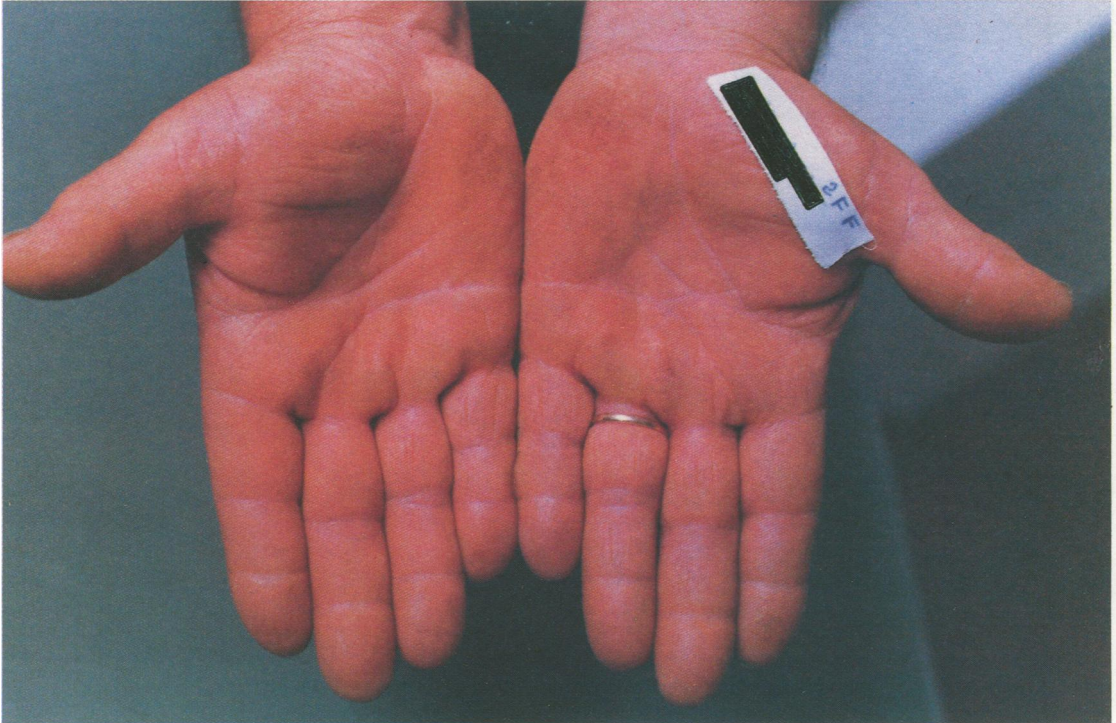
Fig 1 Dermatosis from resorcinal in subject employed on the manual machines.