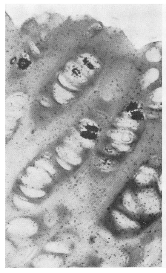
Fig. 3.—Proximal tibial growth plate of a normal rat showing labelled nuclei in the growth columns. Autoradiograph, counterstained neutral red, × 500.

of the autoradiographs showed that hydrocortisone caused a reduction in the number of radioactive growth plate nuclei and this was confirmed by measurements of the labelling index (labelling index = ratio labelled nuclei : total nuclei). The range for the normal growth plates was 0.055 to 0.134(mean 0.08) compared with a range of 0.005 to 0.044 (mean 0.023) in the rats treated with hydrocortisone. This difference is statistically highly significant (P < 0.001).