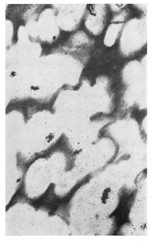
Fig. 4.—Labelled nuclei in proximal metaphysis of normal rat tibia. Autoradiograph, counterstained neutral red, \times 500.

differentiate the various types of cell in the population, for so many are of intermediate or indeterminate character (Fig. 4). The results confirmed that the overall cellularity of this region in the hydrocortisone-treated rats was significantly lower (P < 0.001) than in the normal rats (Table II, overleaf).