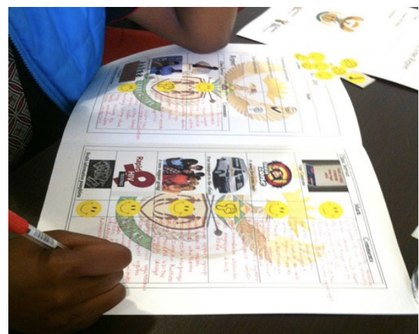
Figure 3. Health Clinic Report Card in Terms of for Example Staff, Services and Availability of Treatment.