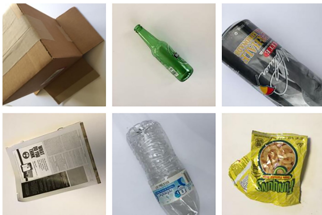
Cardboard, Glass, Metal, Paper, Plastic, Trash