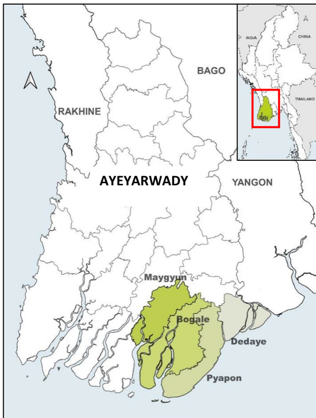
Fig. 1 Map of the study areas

income and improve nutrition among rural households in the Ayeyarwady Delta, Myanmar.