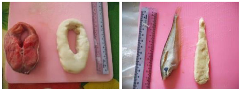
Fig. 2 Samples of fish model used in the study (left, rohu; right, sheat fish)

To elicit 24-h food recall on amounts of fish consumed by respondents, we used fish models as a visual aid (see Fig. 2) to enable easier and more accurate quantification (see Gibson and Ferguson 2008). Respondents were shown relevant models and could hold them to estimate the weight of the amounts of fish consumed.