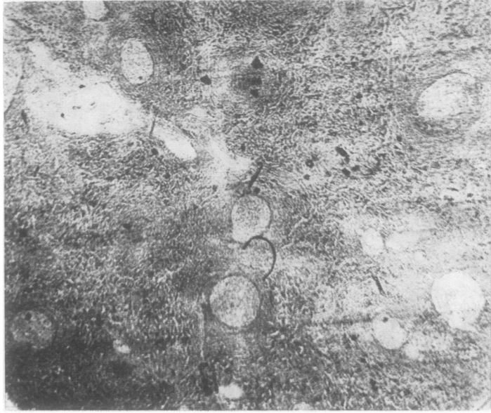
FIG. 1.—Case 6, low-power view showing hyperplasia of Malpighian corpuscles.