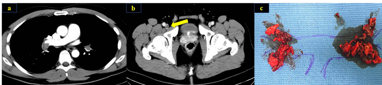
Figure 1. Contrast-enhanced CT scan at the time of hospitalization showed thrombus in bilateral pulmonary arteries (a) and the right common femoral vein (b). Thrombus in pulmonary arteries were removed by surgical thrombectomy (c).

Creatinine clearance, (140 - \text{age}) \times \text{body weight} / (72 \times \text{serum creatinine}) .