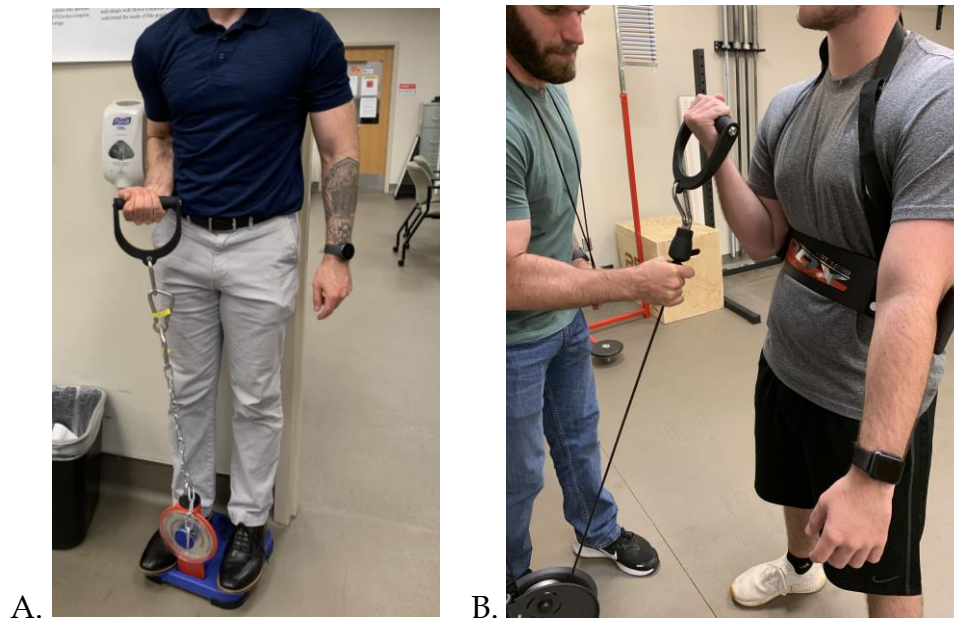
Figure 1. Demonstration of methodologies; A. isometric bicep curl strength; B. eccentric loading

functional trainer weight machine (Rep Fitness, Denver, CO) while wearing a bicep isolator (RDX Sports, Stafford, TX) (Figure 1b).