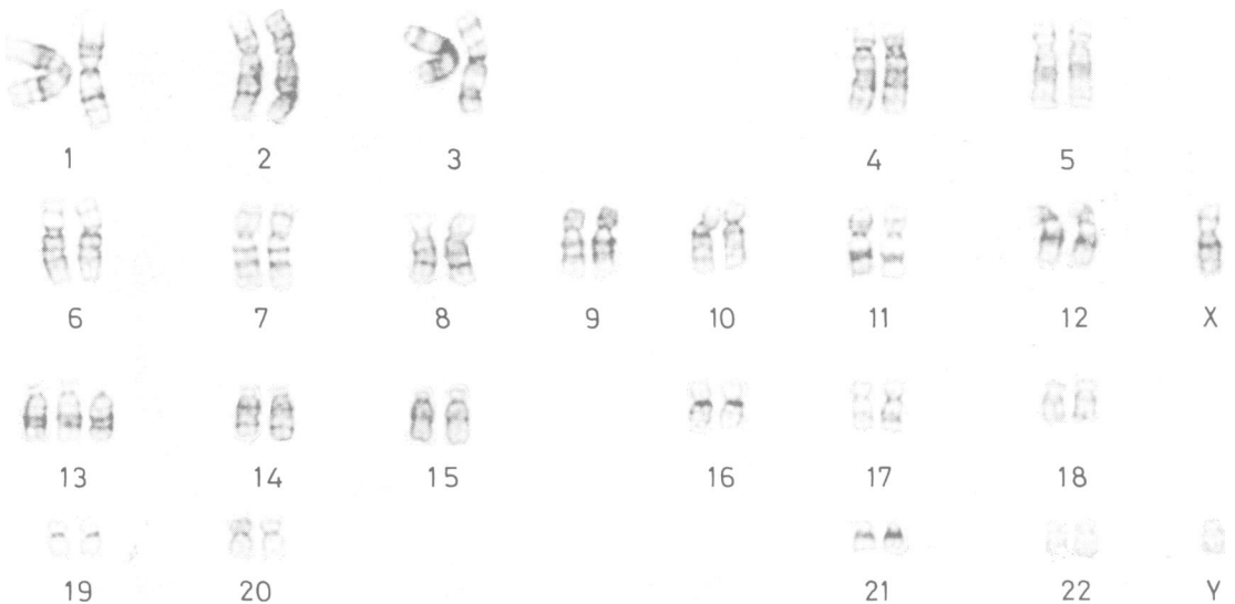
Fig. 3 Karyotype showing 2n = 47, XY+13 from a blood culture cell. The chromosomes were trypsin banded and stained in Leishman.