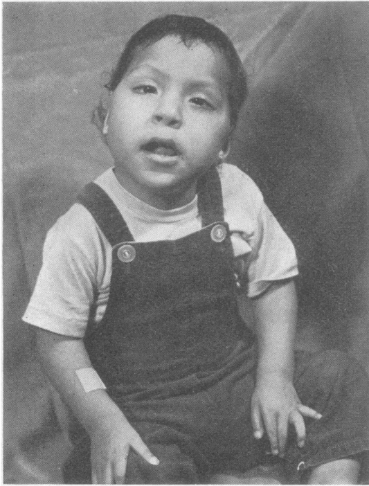
FIG. 1. Propositus. Note asymmetric face and antimongoloid palpebral fissures.