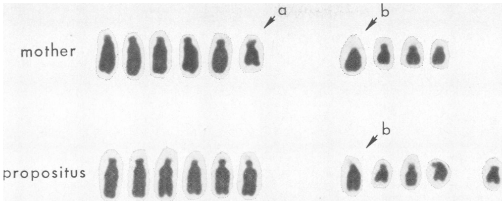
FIG. 3. Partial karyotypes of D- and G-group chromosomes from the mother and the propositus using conventional staining. Arrow a indicates a Dq- chromosome while arrow b indicates Gq+ chromosome. In the propositus the Gq+ chromosome was initially mis-karyotyped as a long Y chromosome.