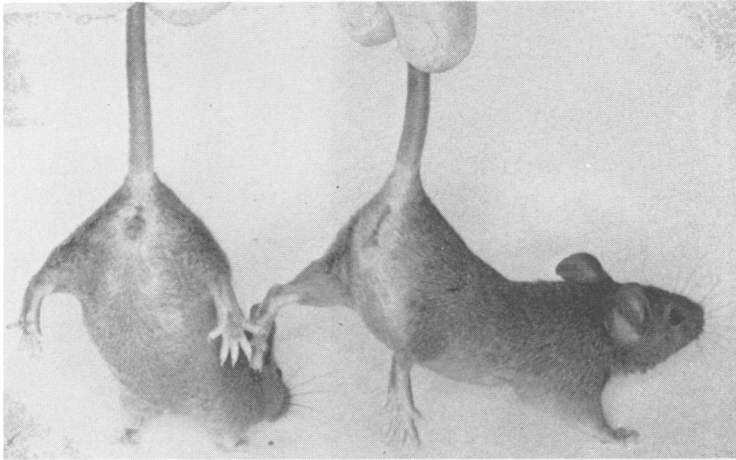
Fig. 2 Rear view of stumpy (left) and normal littermate (right).

not breed well at that stage, heterozygotes were crossed with heterozygotes of brachymorphic, bm , achondroplasia, cn , and stubby, stb , which also have breeding difficulties, and homozygous stm and bm were used where possible; these crosses tested allelism with the three mutants (in chromosomes 19, 4, and 2, respectively (Lane and Dickie, 1968)). Outcrosses were also made to linkage testing stocks, and multiple backcrosses made in which stm was homozygous; the markers were Danforth's short tail, Sd , and tan-belly, a t (chromosome 2), brown, b (chromosome 4), hammer-toe, Hm (chromosome 5), sombre, e so (chromosome 8), short-ear, se , and Maltese dilution, d (chromosome 9), and twirler, Tw (chromosome 18). Between 80 and 400 progeny were bred for each marker tested. These backcrosses also gave data on sex-linkage and sex-limitation.