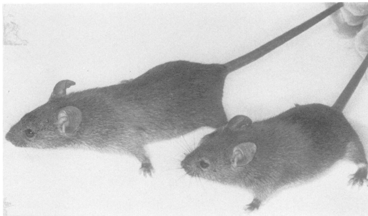
Fig. 1 Adult normal mouse (left) and stumpy littermate (right).