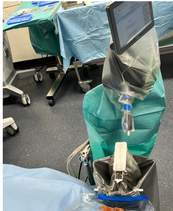
Figure 3. The draping of the PSS contains the instrument manipulator, trocar holder, motion controller, and cables. The extra draping, which maintains the sterility of the instrument manipulator during the introduction of anesthesia, has already been removed.