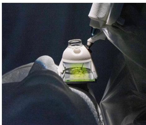
Figure 1. Practical training simulating epiretinal membrane peeling in order to familiarize the surgeon with the functionality of the Preceyes Surgical System (PSS). The phantom eye contained a gelatin layer with superficial embedded thin paper to be peeled during the training.

Two experienced vitreoretinal surgeons (M.D.B. and F.M.H.) received intensive training for the operation of the PSS. In the theoretical part, all functions and safety measures of the PSS were explained and demonstrated by the PSS team. For the practical part, a phantom eye containing a gelatin layer with a superficial embedded thin paper was provided to exercise epiretinal membrane peeling (Figure 1). The phantom eye was used bilaterally to familiarize the surgeon with using the motion controller in both hands.