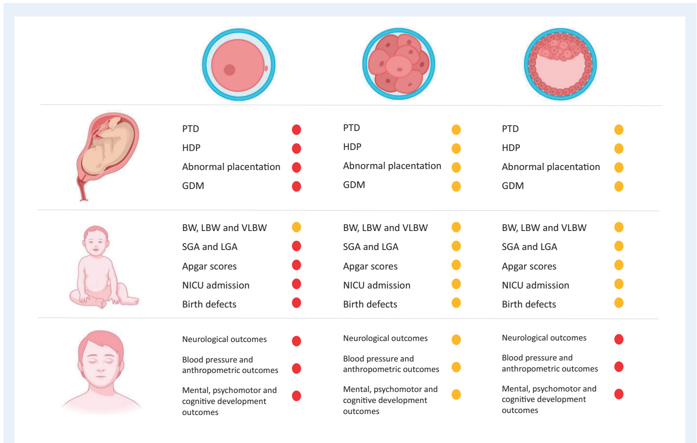
Figure 2. Schematic representation of the available evidence on obstetric, neonatal, and long-term outcomes after embryo biopsy. Findings following biopsy of the polar body, blastomere, and trophectoderm (left to right, top row) are presented. The amber symbol represents weak and/or a controversial body of evidence, for which further research is required. The red symbol warns that no evidence on safety exists. The illustration was created with BioRender.com. BW, birthweight; GDM, gestational diabetes mellitus; HDP, hypertensive disorders of pregnancy; LBW, low birthweight; NICU, neonatal intensive care unit; PTD, preterm delivery; VLBW, very low birthweight.

potential risks for subsequent offspring development is a concern. In line with this observation, evaluation of the potential adverse maternal and offspring outcomes after biopsy treatment was the main aim of this scoping review. To summarize our findings, this study showed a lack of conclusive evidence in support of increased adverse obstetric, neonatal, and long-term outcomes in conceptions after biopsy for PGT.