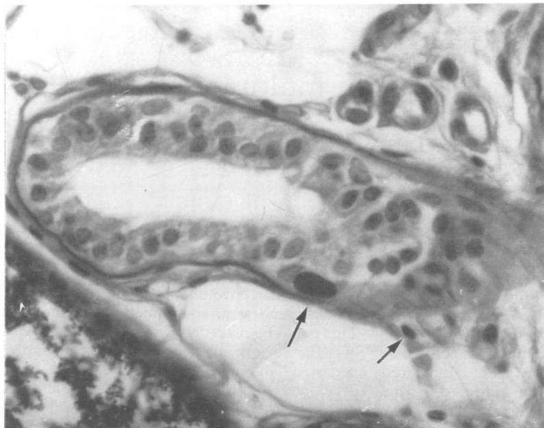
Figure 1 Axillary skin apocrine sweat gland (PAS-diacetate \times 400 ). Oval periodic acid-Schiff (PAS)-positive inclusion bodies are present in the basal side of the acini (arrows) with predominance of the inclusions in the myoepithelial cells.