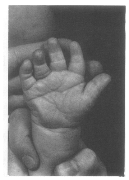
FIG 3 View of the patient's right hand showing abnormal palmar creases, brachydactyly, and fifth finger clinodactyly.

Congenital heart disease consisting of a bicuspid aortic valve and possible cor triatriatum has been documented in one patient.<sup>2</sup> Apparent hepatosplenomegaly has been noted in three infants. This is likely to be a consequence of the short, narrow thorax rather than true visceromegaly. Liver biopsy in case 7 in the table showed no abnormality.