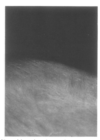
FIG 4 View of the scalp at the age of nine months showing poor growth of fine, sparse hair.