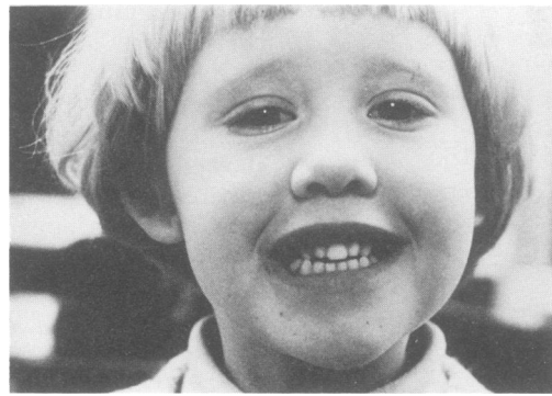
Figure 6 III.12 showing single central upper incisor and smooth border to upper lip.

(III.4) had learning difficulties and attended a special school.