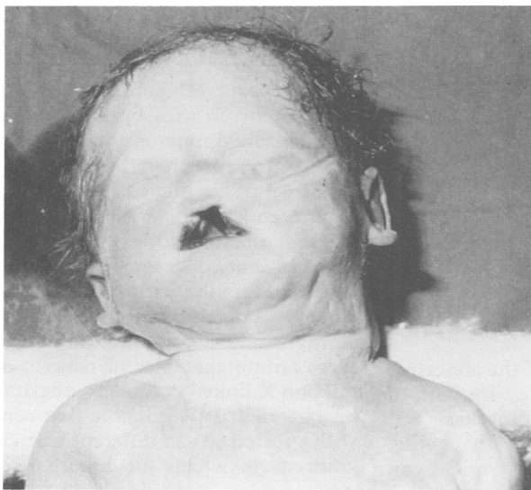
Figure 3 III.9 showing hypotelorism, single nostril, and absent philtrum.

with an opaque cornea. There was a single nostril, a large midline cleft of the upper lip opening into the nasal region, and a wide cleft of the hard and soft palates. The cerebral hemispheres were fused with a single large ventricle. The optic nerves and pituitary were absent; the cerebellum was present but small.