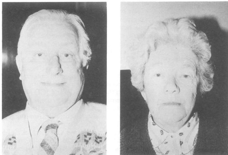
Figure 7 I.1 and I.2, the maternal grandparents of the affected children.

The maternal grandparents of the abnormal children are shown in fig 7. They are both of normal intelligence. The grandmother (I.2) has an OFC greater than the 50th centile. Although the grandfather (I.1) gives an impression of hypotelorism, this is not borne out by eye measurements. His OFC is on the 50th centile. He has non-eruption of the upper canines. His parents are shown in fig 8, his father again giving the impression of hypotelorism. However, the proband feels that her sisters both resemble their mother in facial appearance.