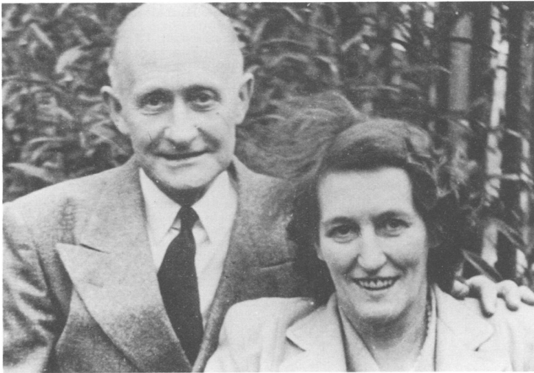
Figure 8 The parents of I.1. The father gives the impression of hypotelorism.