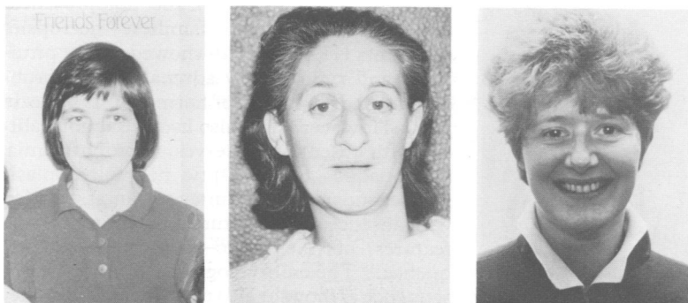
Figure 4 The three sisters II.2, II.4, and II.6. II.4 and II.6 are presumed gene carriers.

with an opaque cornea. There was a single nostril, a large midline cleft of the upper lip opening into the nasal region, and a wide cleft of the hard and soft palates. The cerebral hemispheres were fused with a single large ventricle. The optic nerves and pituitary were absent; the cerebellum was present but small.