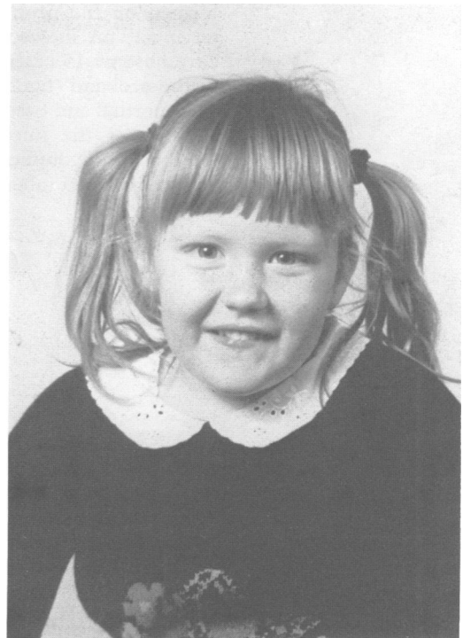
Figure 1 The proband aged 4½ years.

Received 18 September 1992. Revised version accepted 27 November 1992.