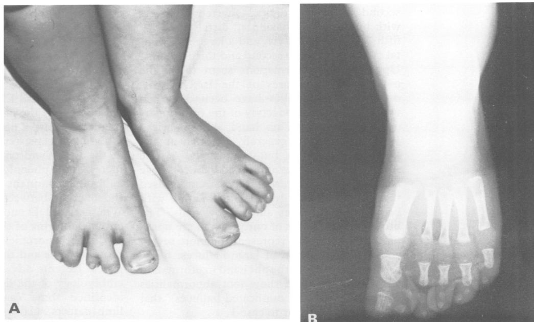
Figure 3 (A) Feet of case 1 showing partial duplication of the big toes and syndactyly between the left 2nd and 3rd toes and 4th and 5th toes. (B) X ray examination of the right foot showing duplication of the hallux.

tory showed recurrent dacryocystitis and a chronic, mild, purulent eye discharge, mainly after sleep. The child had poor lacrimation and the lacrimal puncta were hypoplastic. Scalp hair was sparse and brittle. The palate, skin, and nails were normal. The hands were normal apart from slightly low implantation of the thumbs. Examination of the feet showed soft tissue syndactyly of the left second and third and fourth and fifth toes (fig 3A), with large big toes that were partially duplicated on x ray examination (fig 3B). She had stereotyped and psychotic behaviour. Auditory brainstem evoked potentials and audiogram indicated bilateral sensorineural hearing loss, with no recognisable reaction up to 70 dB. Urine analysis, renal ultrasound, CT scan of the brain, and fundus examination were normal. Chromosome analysis was normal 46,XX. Metabolic screening showed no abnormalities. The maxillary deciduous right second molar is missing at 30 months of age.