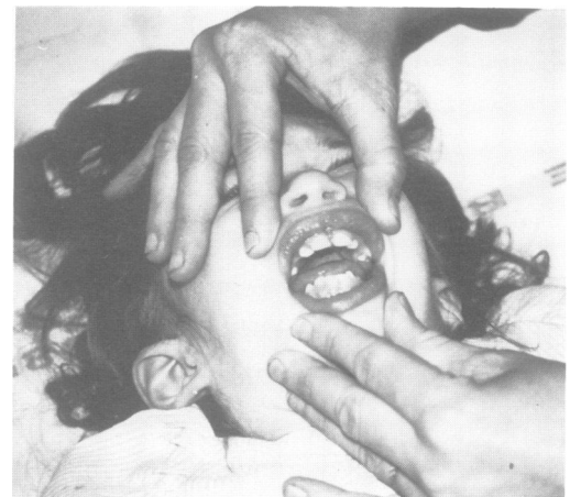
Figure 2 Poor implantation of deciduous teeth of case 1.

Department of Paediatrics and Medical Genetics, Pellegrin-Children's Hospital, Place Amélie Raba Léon, 33076 Bordeaux Cedex, FRANCE. D Lacombe F Serville D Marchand J Battin