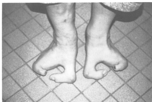
Figure 4 Bilateral split foot of case 2.

The mother of case 1 was 25 years old and had typical split foot deformity of both feet (fig 4) and severe malformations of the upper limbs with two ulnar digits on each hand. Radiologi-