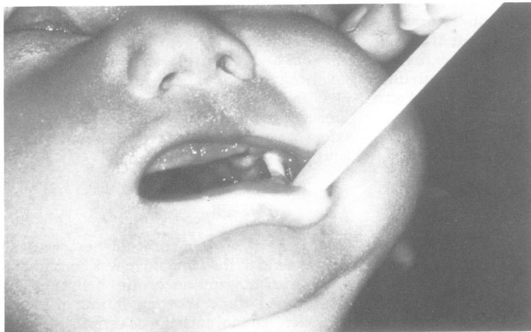
Figure 2 Gingival fusion and cleft palate.