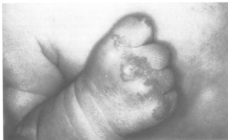
Figure 3 Erythematous macular rash on the right hand.