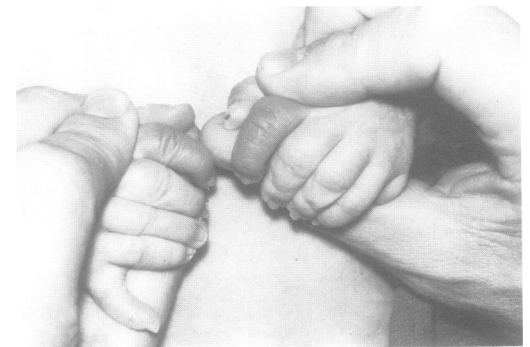
Figure 2 Case 1 showing bilateral postaxial polydactyly.