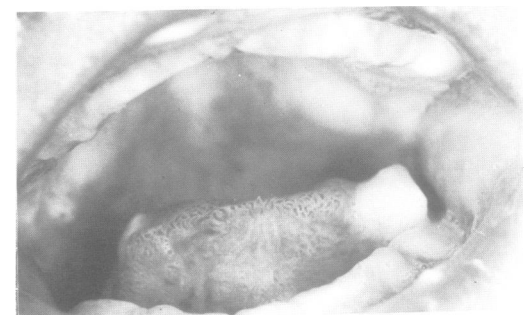
Figure 3 Case 1 showing tongue nodules.

Department of Paediatric Neurology, Newcastle General Hospital, Westgate Road, Newcastle upon Tyne NE4 6BE, UK. R A Smith D Gardner-Medwin