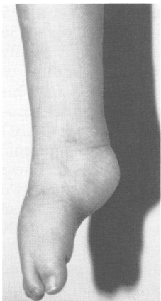
Figure 3 Thin streaky pigmentation on the leg of the proband.

Ophthalmological investigation showed divergent strabismus at the age of 8 months. At the age of 13 months atypical infantile spasms (with features of partial seizures) were noted. EEG showed hypsarrhythmia. With sodium valproate-vigabatrin medication the fits disappeared. From the age of 15 months the child has had frequent and severe respiratory and ear infections. At the age of 15 months the