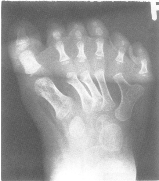
Figure 3 Right forefoot at 3 years 7 months showing postaxial polydactyly with Y shaped metatarsal V.

although an extretory urogram failed to show tubular ectasia; however, it excluded obstructive uropathy.