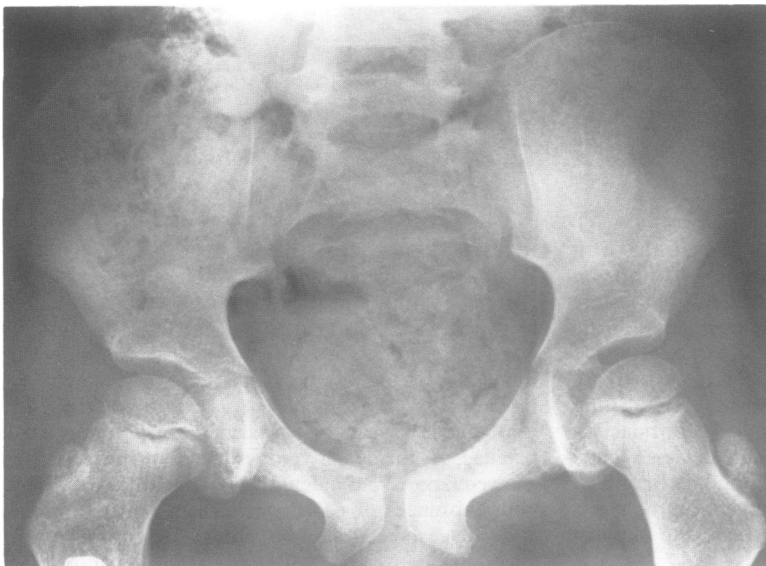
Figure 4 Pelvic radiographs at 6 years 7 months. The rami of the pubic bones are missing, but the acetabula are present.

The combination of intrauterine growth retardation, minor craniofacial anomalies including short nose and epicanthic folds, postaxial polydactyly, hypospadias, excess of whorls on the fingertips, 2/3 syndactyly of the toes, and mental retardation is characteristic of the Smith-Lemli-Opitz syndrome. 1-3 Parental consanguinity also fits with the autosomal recessive inheritance of this syndrome. However, our patient has additional striking skeletal abnormalities and renal and immunological features which have not