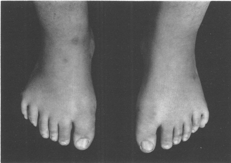
Figure 2 Both feet of the patient showing postaxial polydactyly and abnormal big toenails.

fingers on the base of the ulnar side of the fifth proximal phalanges, no simian creases, 10 whorls on the fingertips, and very mild cutaneous syndactyly between fingers 2 to 5. There were flat arches of the feet, complete sixth rays of the toes, clinodactyly of the halluces and fourth toes, appendages on the base of the fibular side of the sixth toes (indicating heptadactyly), bilateral 1/3 cutaneous syndactyly between toes 2 and 3, and hypoplastic toenails. There was hypertrichosis over the back and extremities. Muscle tone was decreased, and finger and toe joints were hyperextensible. The remainder of the physical examination was normal.