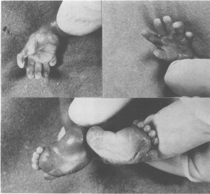
Figure 3 Patient 4: acral anomalies.