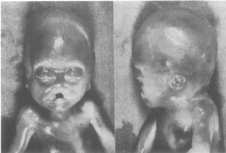
Figure 2 Patient 4: facial features.

Hydrocephalus and holoprosencephaly were suspected on ultrasound in this fetus. An amniocentesis was performed despite oligohydramnios. The fetal karyotype was 46,XY. Acetylcholinesterase electrophoresis and \alpha fetoprotein level were normal. However, owing to the severity of the hydrocephalus, a termination of pregnancy was performed at 20 weeks. The fetus weighed 300 g. External anomalies included a median cleft lip and complete cleft palate, hypertelorism, a short neck (fig 2), bilateral postaxial polydactyly of both upper and lower limbs, and club feet (fig 3). Necropsy showed incomplete segmentation of the lungs, a ventricular septal defect, and bilateral hypoplastic kidneys. The extremely small brain was explained by alobar holoprosencephaly (fig 4 b,c,d). The suspected hydrocephalus was in fact an almost empty skull (fig 4a). Gyration was grossly abnormal. The cerebellum and the eyes were normal. This fetus was the product of the first pregnancy of a young gypsy couple (mother aged 20) with a high degree of consanguinity (probable brother-sister union). With a different partner, the mother had had another pregnancy two years earlier which ended in a stillborn male which was not examined.