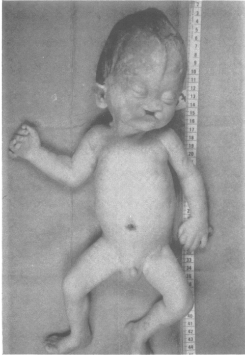
Figure 1 Patient 3.

Weight was 1760 g, length 44 cm, and OFC 34 cm. Premaxillary hypoplasia with bilateral labiopalatine clefts, microphthalmia, bilateral upper limb postaxial polydactyly, and slight penile hypoplasia were observed (fig 1). Necropsy showed an endocardial cushion defect, a left vena cava, abnormal pulmonary segmentation, aplasia of the gall bladder, and testicular