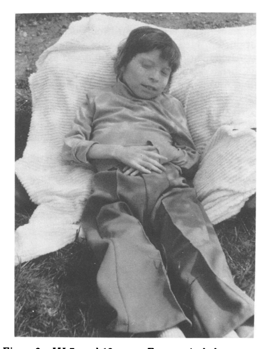
Figure 3 III-7 aged 12 years. Features include microcephaly, triangular shaped nose with anteverted nares, wide mouth with prominent lower lip and large central incisors.

Case 2 (III.7) was identified when a family pedigree was obtained (fig 1). His mental retardation had previously been attributed to cerebral palsy. He was