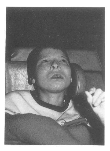
Figure 4 III.7 aged 25 years.

born by spontaneous vaginal delivery but according to parental report "he was stuck" during delivery. His birth weight was 2730 g. At 1 year of age he developed convulsions which have persisted. Severe mental and growth retardation was apparent from infancy and at 25 years he still has difficulty sitting unsupported. He is unable to walk or stand and has no words. He also tends to put his hand to the back of his throat to induce vomiting.