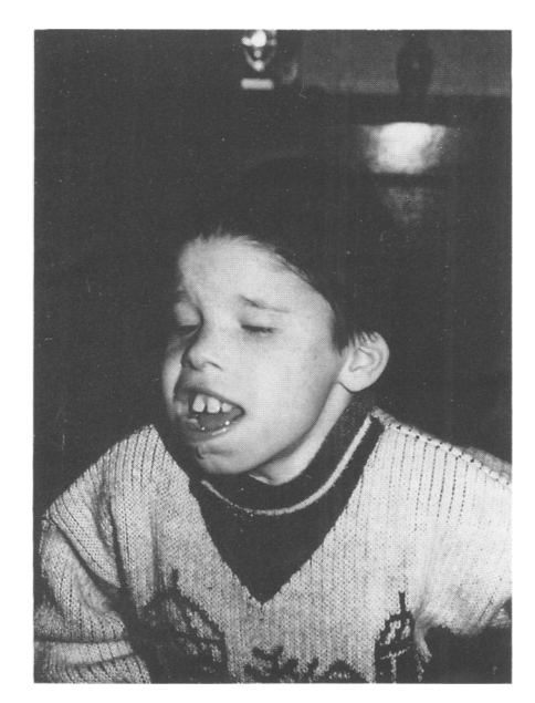
Figure 2 Proband IV-2 aged 13 years.

Recurrent anaemia, with Hb values as low as 7.6 g/dl, and hypochromic blood films have been