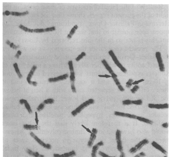
Figure 3 Partial C banded metaphase from the patient. Arrows indicate examples of PCS.

The initial clinical diagnosis in this case was Baller-Gerold syndrome and the skeletal survey was undertaken to investigate further the aetiology of short stature in this condition. The lower limb abnormalities on the skeletal survey led us to review the case, when the similarity of the facial phenotype to that of Roberts syndrome was noted and cytogenetic studies were undertaken. In view of the finding of PCS it is