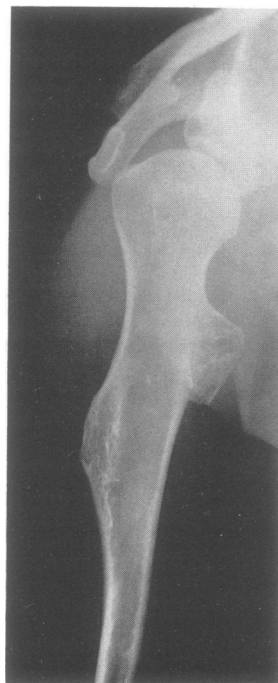
Figure 2 Right humerus illustrating two exostoses.

reciprocal translocation involving chromosome 8. It is now increasingly evident that some apparently balanced reciprocal translocations are not without