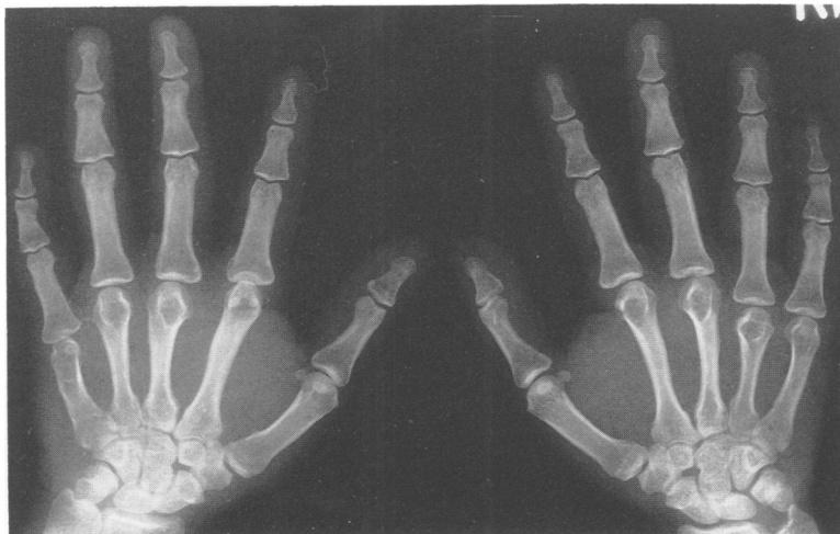
Figure 3 Hand radiographs without cone shaped epiphyses.

deletion 8q24.11→8q24.12 in a patient with characteristic LGS phenotype and that of Fennell et al 6 whose two patients with terminal deletions distal to this, at 8q24.13, showed no obvious features of LGS.