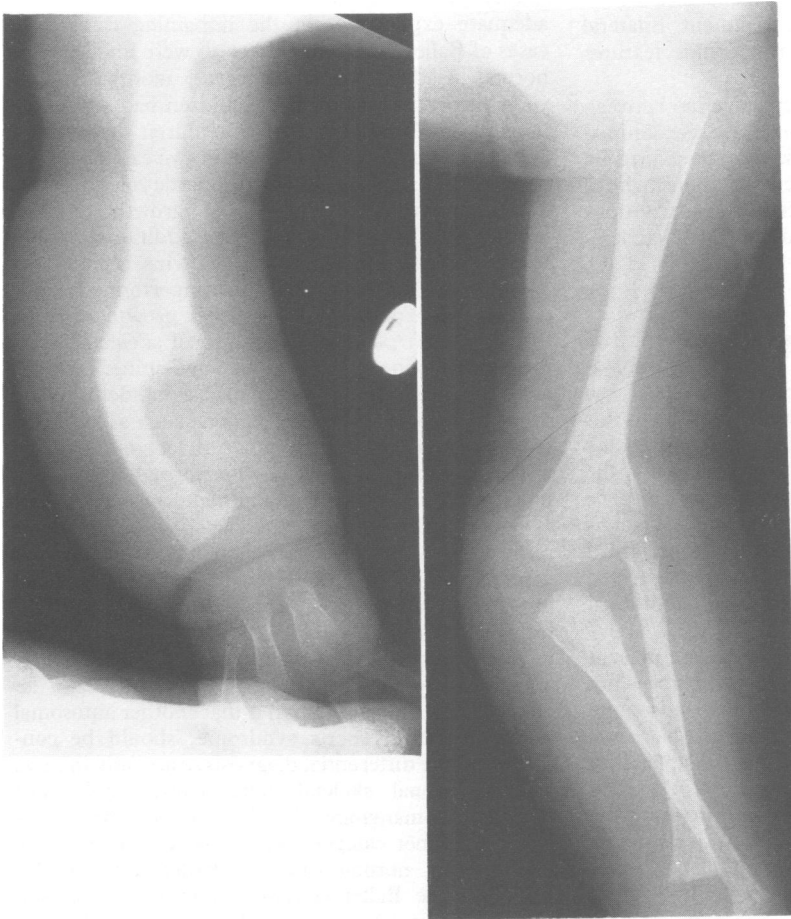
Figure 2 Radiographs of the right arm showing a single forearm bone (ulna) and the left arm showing a hypoplastic dislocated radius.

The metopic suture was ridged and prominent. The left forearm was shortened and the left thumb was missing. The remaining four digits were normal. The right arm was shortened, the elbow joint was missing, and the hand was held in supination. The right thumb was missing and the middle and third digits were syndactylous. Radiographs showed premature fusion of the sagittal and metopic sutures.