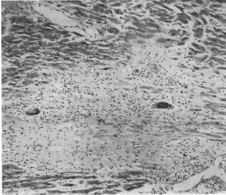
FIG. 2.—Case 2: section of myocardium showing inflammatory exudate with two prominent multinucleated giant cells. Many myocardial fibres have disappeared. (Hæmatoxylin and eosin: \times 75 .)

(Fig. 2). Lesions were present in all parts of the myocardium including the subendocardial region. The inflammatory cells included prominent multinucleated giant cells of Langhans type and of foreign body type, numerous round cells, epithelial cells, fibroblasts, and scanty eosinophils. Much of the inflammatory change was diffuse, but there were a number of circumscribed granulomata and some of the inflammatory lesions were perivascular. In the inflammatory areas, muscle fibres had disappeared and some of the residual fibres were necrotic. One coronary arteriole showed necrosis and cellular infiltration of its wall and was surrounded by inflammatory cells. Stains for acid-fast and other bacilli and for fungi were negative.