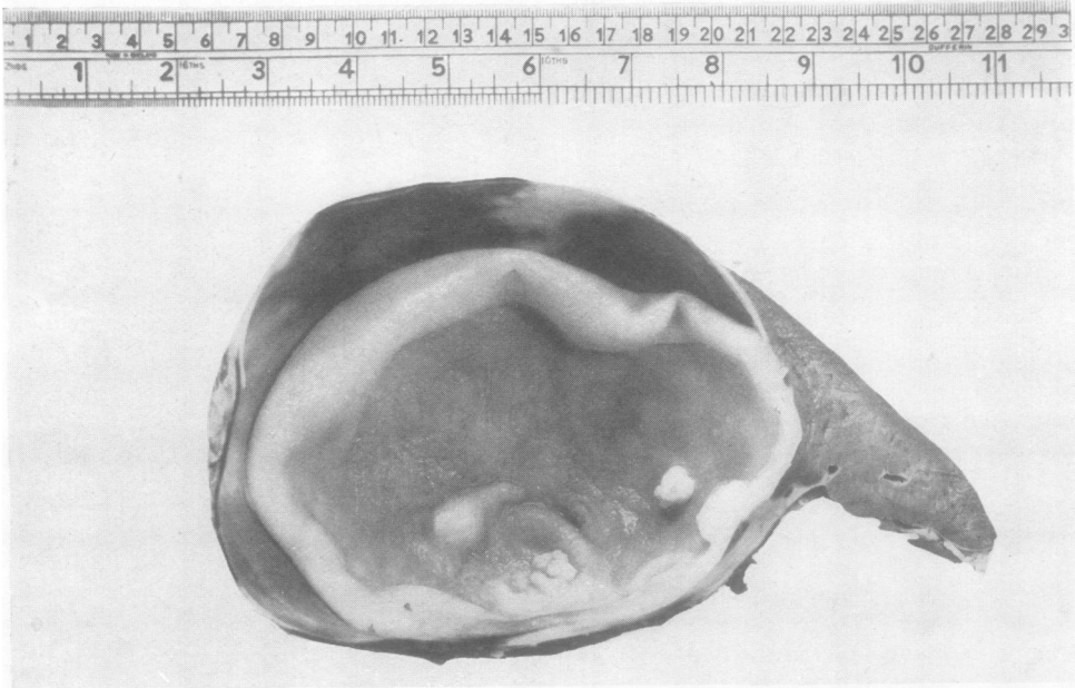
FIG. 5.—Specimen of removed spleen showing contained hydatid cyst.

On May 5, 1950, the left chest was reopened. The left lung was adherent to the previous operative area in the pericardium, and no attempt was made to separate the area of fusion. The incision through the bed of the resected eighth left rib was carried on into the abdomen, the diaphragm split, and the spleen, containing a huge univesicular