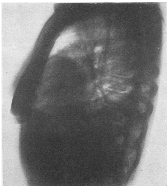
FIG. 2.—Lateral view (left).