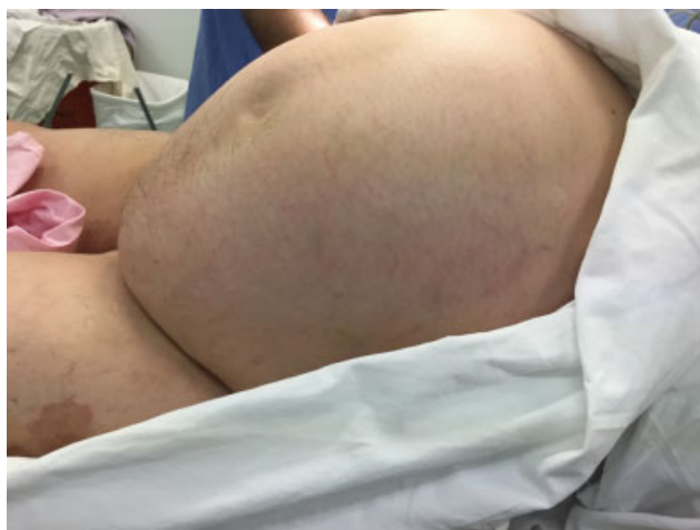
Fig. 1 Giant mass occupying all abdomen.

Surgery can be challenging in these cases. It is quite difficult to consider a minimally invasive approach in a large abdomen, as most of the incisions were xiphopubic. Within the selected