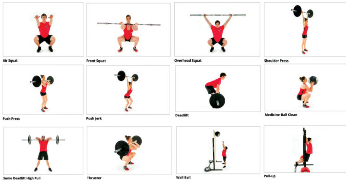
Fig. 1 Basic elements of crossfit.

before and during the quarantine by COVID-19 in CrossFit women and their relationship with training level.