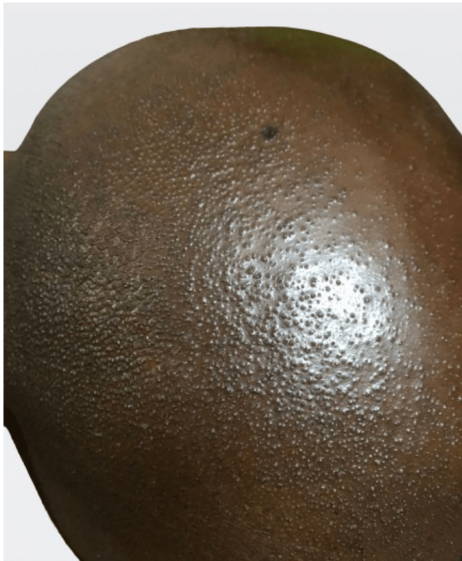
FIGURE 5: Papular skin lesions on the scalp