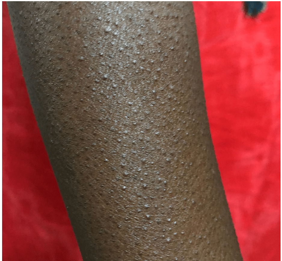
FIGURE 2: Papular skin lesions on the forearm of the girl's mother

Her mother has already papular skin lesions, most prominently on the forearm, but present all over the body from birth, with normal hair all over the body, including eyebrows, eyelashes, axillary, and pubic hair (Figures 2, 3).