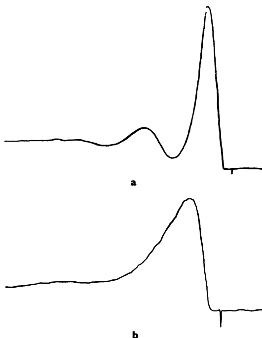
FIG. 3.—Indicator dilution curves from the Cambridge earpiece and recorder following upon injection of Coomassie blue dye into the left atrium in one patient with mitral stenosis and in one with mitral incompetence.

Clinical experience with the transeptal approach to the left atrium is reported, and a technique of left and right heart catheterization adapted to the investigation of patients with mitral regurgitation is described.